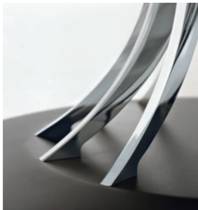
Table with basement in painted cast iron. Laser-cut steel bars chrome-plated or painted. Top in marble, white acrylic stone or in MDF painted in liquid laminate_

Tavolo con base in ghisa verniciata. Gamba in acciaio tagliato al laser cromata o verniciata. Piano in marmo, pietra acrilica bianca o MDF laccato laminato liquido_